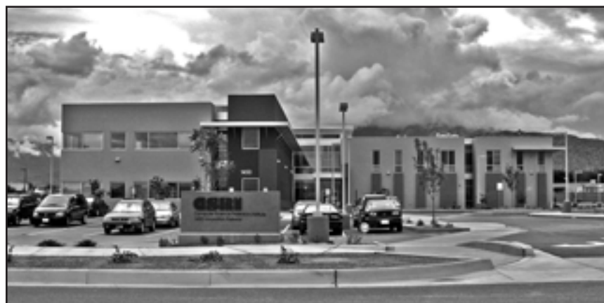
The new CSRI building in Albuquerque, NM facilitates collaborative research.

Finally, information-based computing is increasingly important in many national-security applications. To address this national security need, the CSRI has continued to build a research focus in graph-based and discrete algorithms. This area has been particularly interesting because it has introduced new areas of research at the interface of algorithms, architectures and visualization as scientists begin to incorporate an "information-based" approach to their work, in addition to the more traditional "geometry-based" approach.